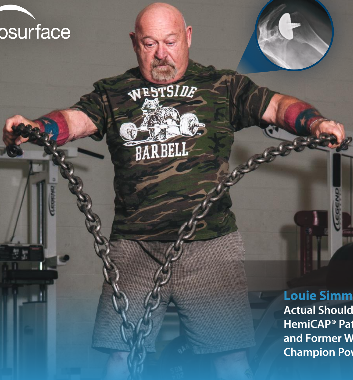
Louie Simmons Actual Shoulder HemiCAP® Patient and Former World Champion Powerlifter

Are your patients looking for a motion preserving alternative to Shoulder Replacement?